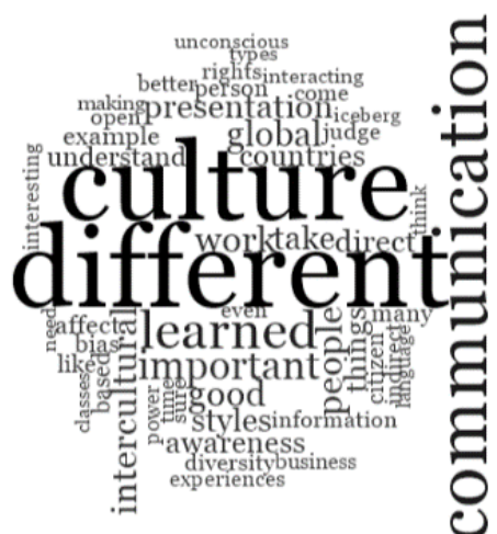
Figure 2 Word Cloud of Survey Responses

Overall, survey responses provide evidence of Impact, some evidence of Engagement, and some identification of barriers to intercultural understanding; therefore, mission fulfilment for indicator 2.2 was minimally achieved.